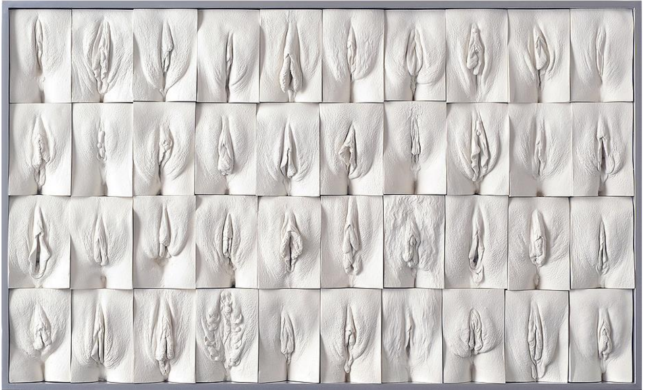
Illustration 2. The Great Wall of Vagina Panel 4, from McCartney